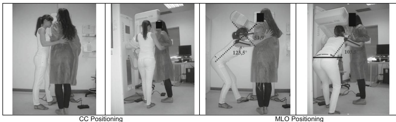
Fig. 1 Postures assumed by the radiographer with similar height compared to the patient

the patient, the breast area that the radiographer visualised was reduced, showing a tendency for the radiographers to compensate for the height difference by standing on their tiptoes [1]. Both legs remained extended and the left foot placed on the compression foot pedal.