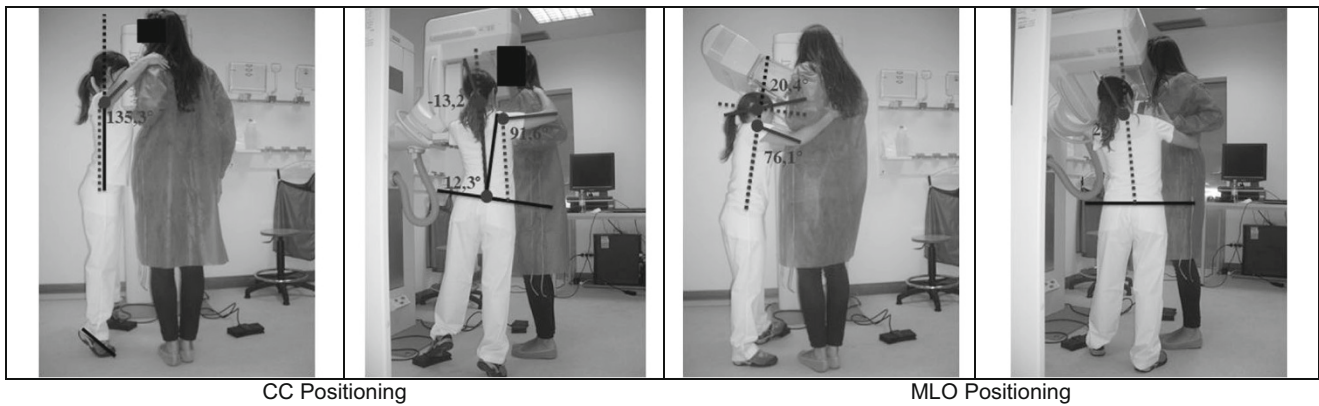
Fig. 2 Postures assumed by a radiographer smaller than the patient